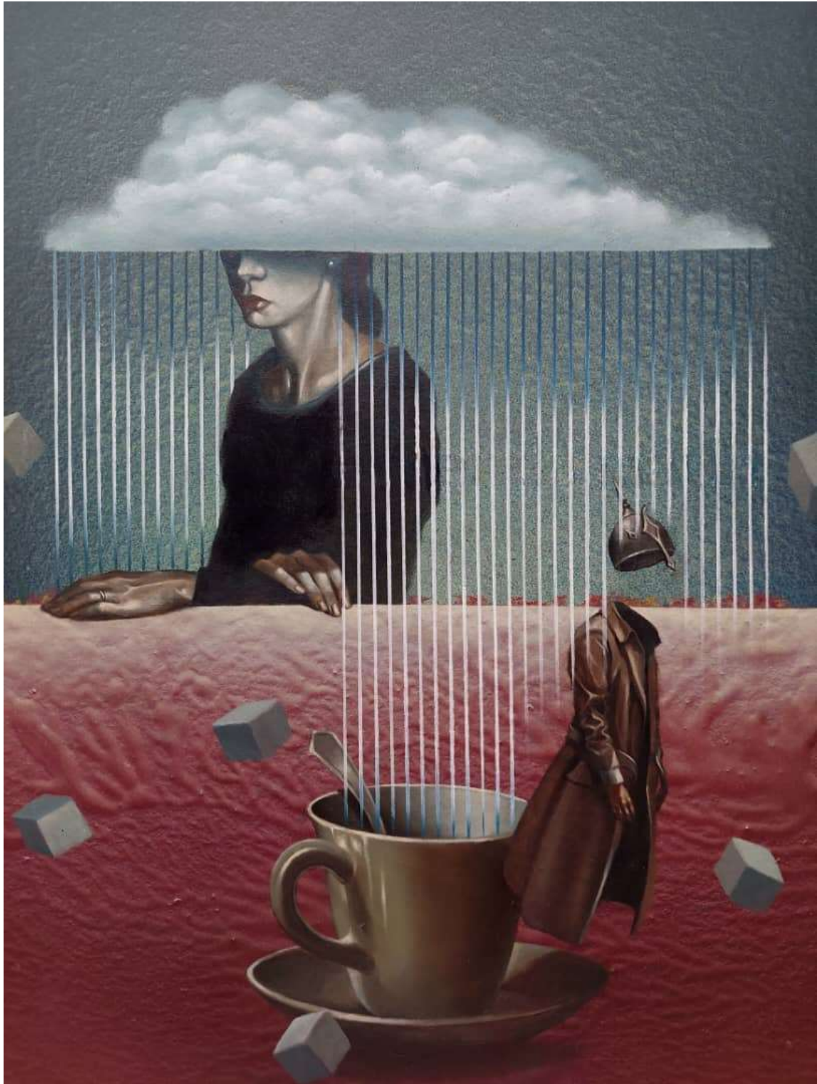
Title: The last breakfast Technique: oil and acrylic on cardboard Size: 30-43 cm The year of creation of art work: 2020