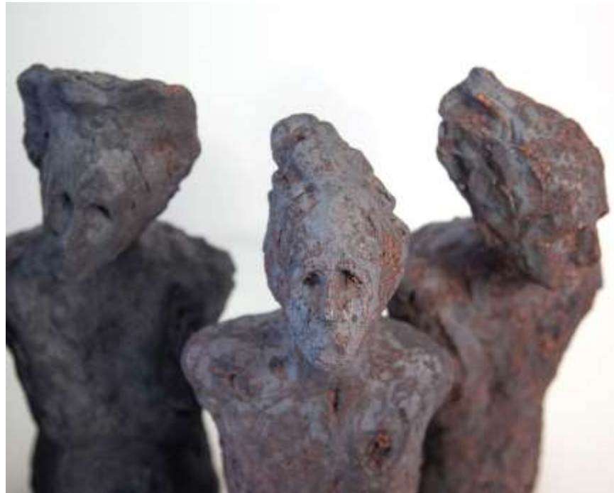
Title: Mathers of war Technique: Raku ceramics Size: 34-80-25 cm The year of creation of art work: 2024