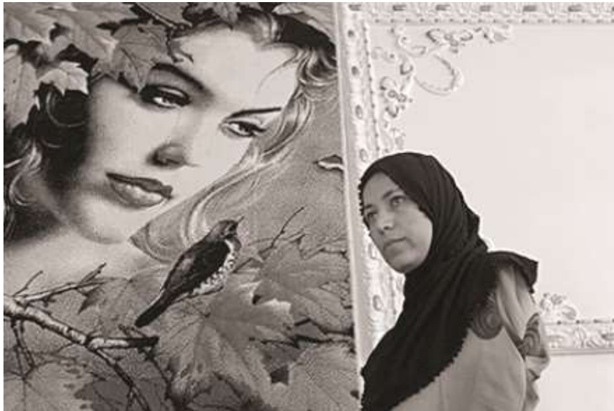
Title: War victims Technique: Digital photo printing Size: 100-70 cm The year of creation of art work: 2001