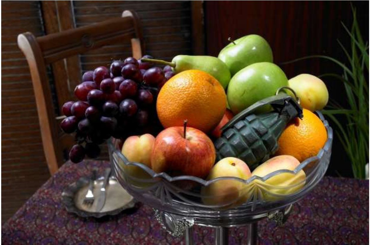
Title: Nil, Nil Technique: Digital photo printing Size: 100-70 cm The year of creation of art work: 2008