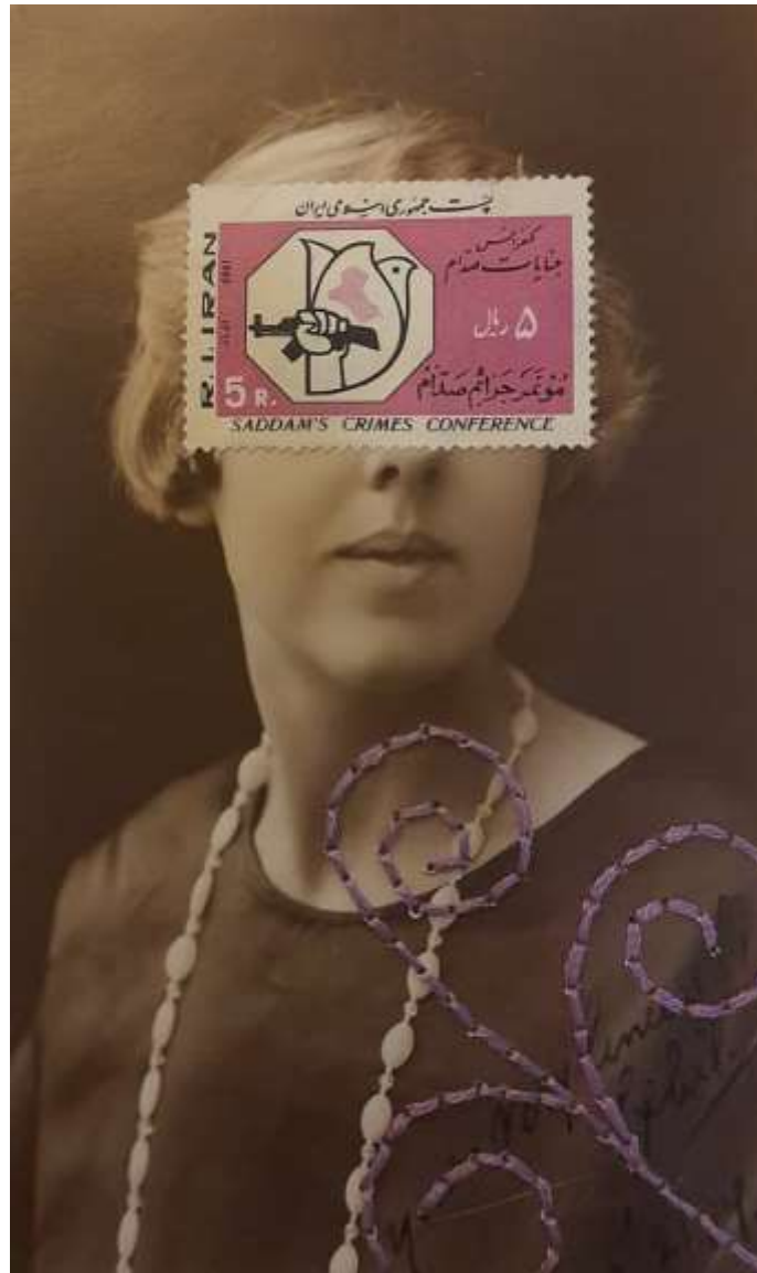
Title: I know the war Technique: Collage Size: 9-14 cm The year of creation of art work: 2024