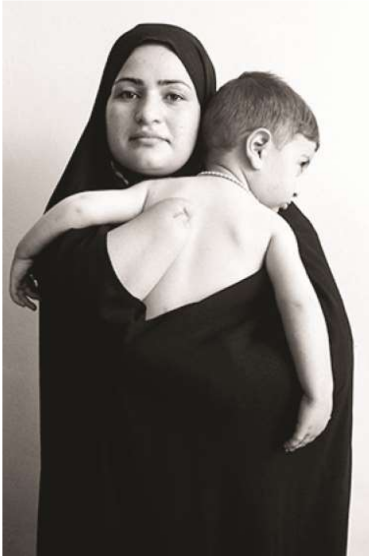
Title: War victims Technique: Digital photo printing Size: 100-70 cm The year of creation of art work: 2001