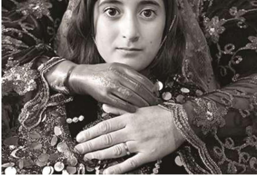
Title: War victims Technique: Digital photo printing Size: 100-70 cm The year of creation of art work: 2007